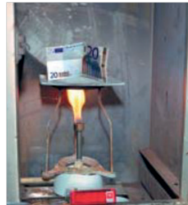
Test at 890 °C